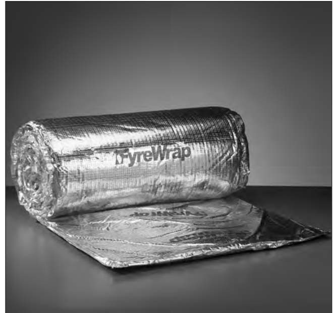
FyreWrap 0.5 Plenum Insulation

Core Material: FyreWrap 0.5 Plenum Insulation incorporates Insulfrax® Thermal Insulation as its core material. Insulfrax is a high-temperature insulation made from a calcia, magnesia, silica chemistry designed to enhance biosolubility. It provides excellent insulation in a noncombustible blanket product form.